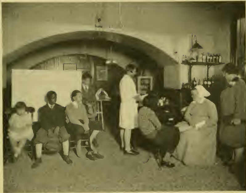
Scene in the Dispensary